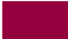
77 64675 Dark Purple