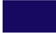
72 64198 Dark Blue