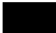
14 64888 Black