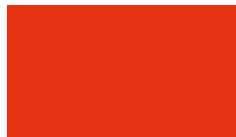
17 64779 Cadmium Red