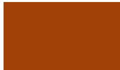
16 64226 Nut Brown