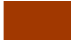
17 64723 Iron Red