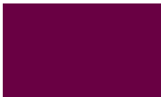
77 1234 Purple