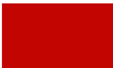
17 1252 Cardinal