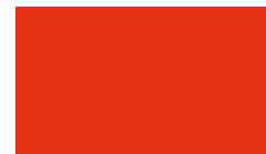
17 1251 Poppy