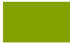
11 15436 Moss Green