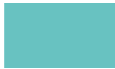
11 15143 Aqua