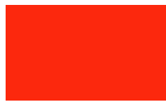
17 15773 Cherry