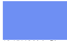
12 15112 Light Blue