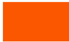
13 15575 Tangerine