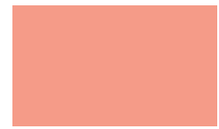
17 15072 Rose