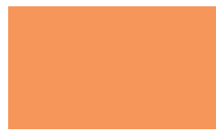
13 15503 Salmon