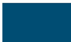
12 64124 Cyan