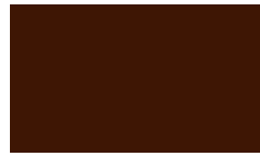
16 64228 Dark Brown