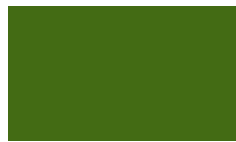
11 64447 Chrome Green