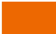
17 64777 Cadmium Orange