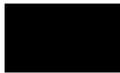
14 64888 Black