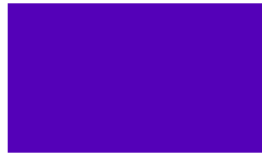
72 64197 Royal Blue