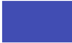
12 64115 Blue