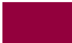
77 64675 Dark Purple