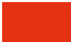
17 64779 Cadmium Red