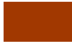
17 64723 Iron Red