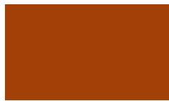
16 64226 Nut Brown