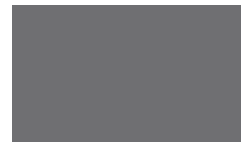
15 64885 Silver Grey