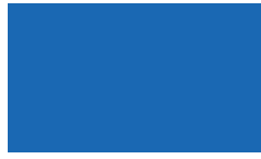
12 57174B Cyan Blue