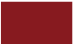
77 1645 Dark Maroon