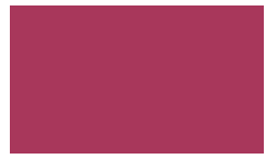
77 1644 Maroon