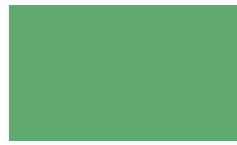
11 57473 Apple Green