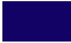
72 57193 Delft Blue