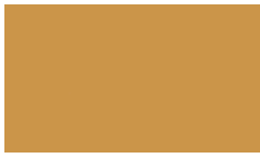
16 57871 Light Brown