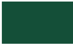
11 57472 Blue Green