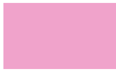
77 1643 Pink