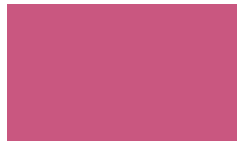
77 1651 Light Purple