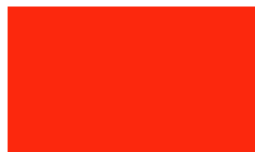
77 436 Ruby