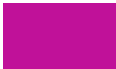
77 435 Amethyst