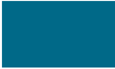
12 1234 Turquoise