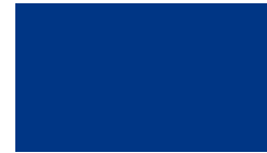
12 1232 Azure