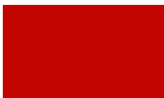
17 1252 Cardinal