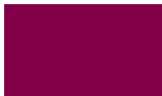
77 1241 Magenta