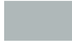
15 1230 Grey