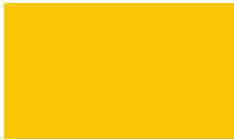
13 1233 Saffron